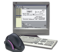
Magtek Imager with PC